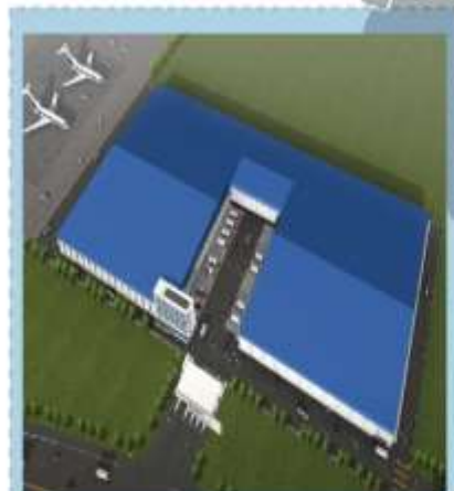
华中冷链港 YIDU-Zhengzhou Airport D.C.