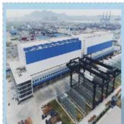
大连港毅都冷链 DALIAN PORT YIDU Cold Chain

storage capacity: 1.79 million tons amount of investment: 8.57 billion yuan