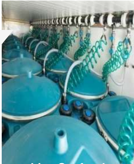
Live Seafood Container