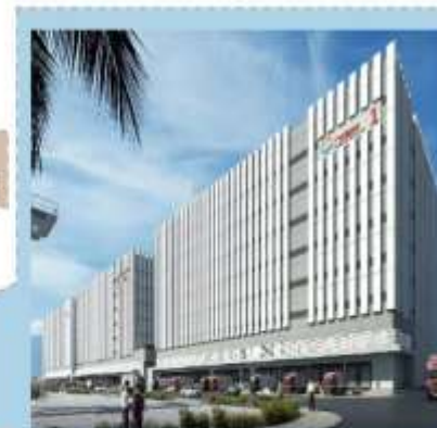
华南冷链港 YIDU-Guangzhou Southern D.C.