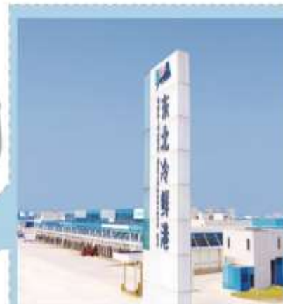
东北冷链港 PDA-YIDU Northeastern D.C.